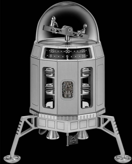
74.6008/144 HUMAN TO ALIEN