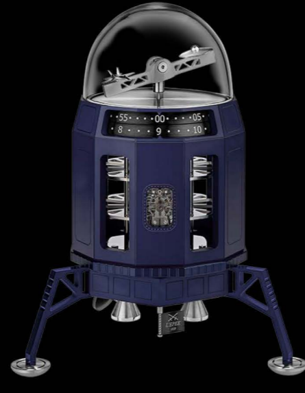
74.6008/204 JET TO SPACESHIP