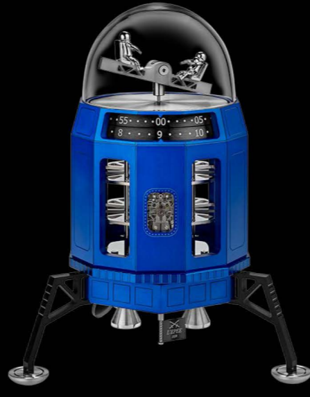
74.6008/404 HUMAN TO HUMAN